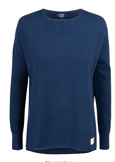
Navy melange 554