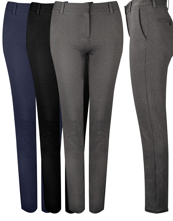
Dark navy 580