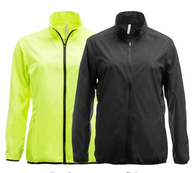
Neon yellow 101