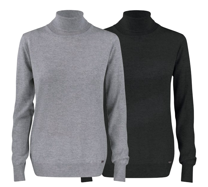
Grey melange 95