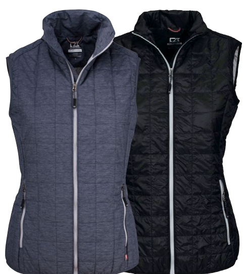
Anthracite navy melange 586