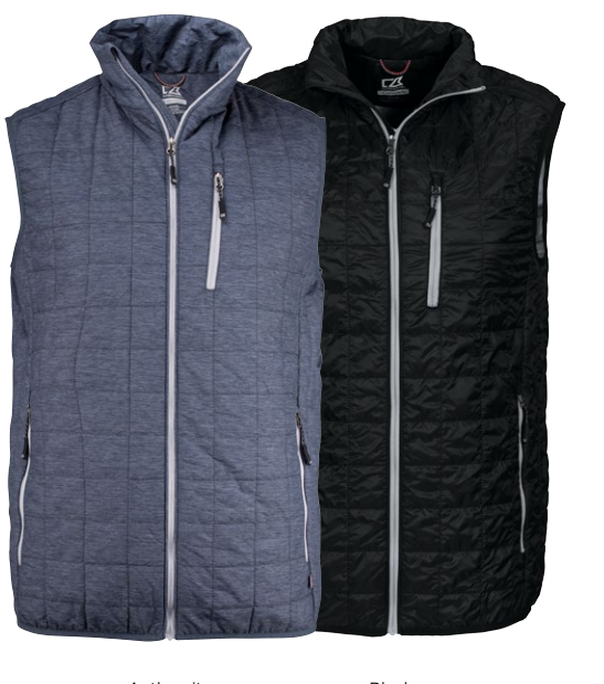
Anthracite navy melange 586