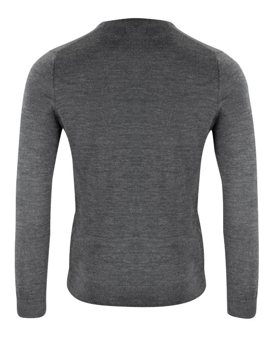
Anthracite melange 955