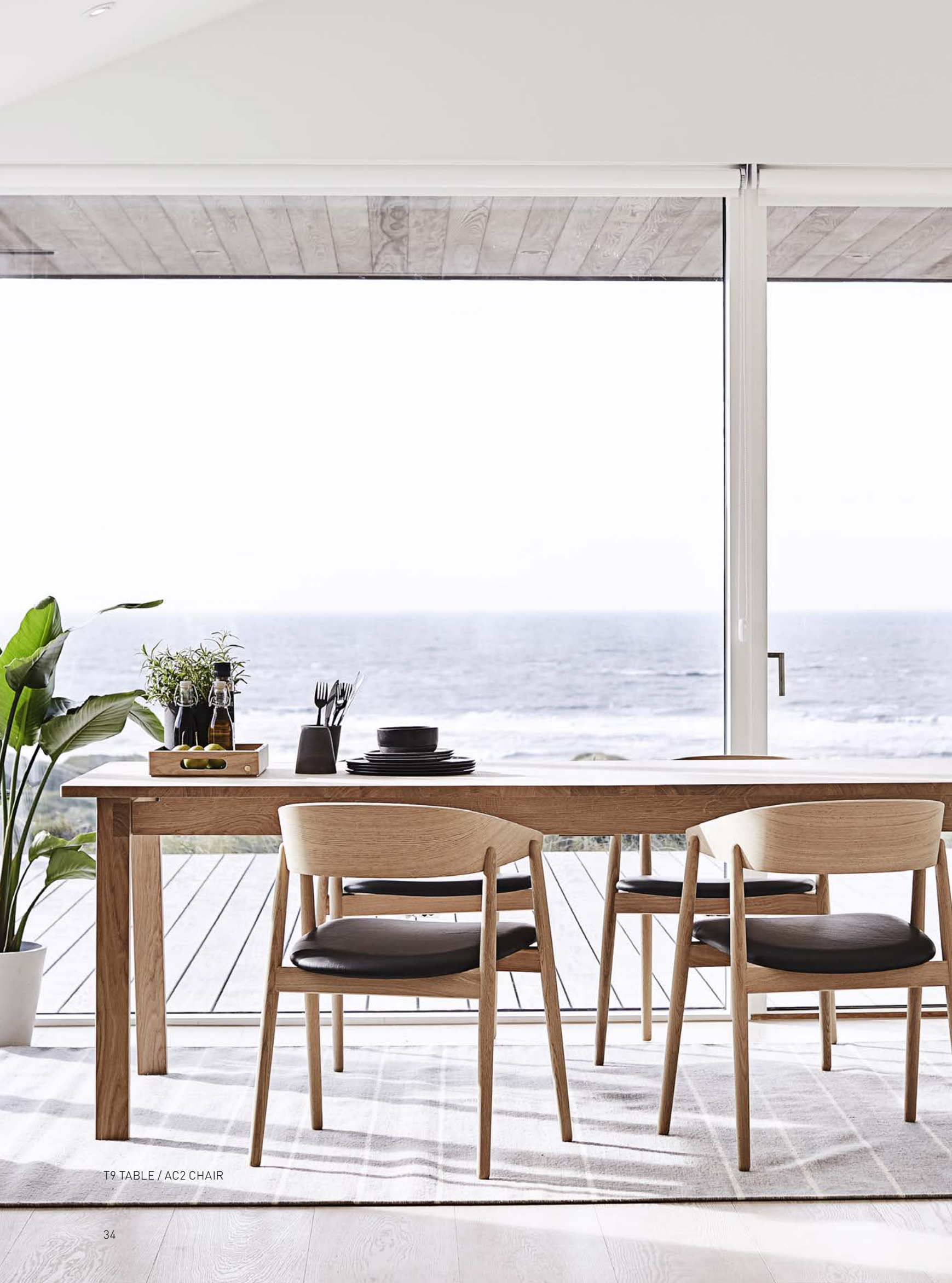
T9 TABLE / AC2 CHAIR