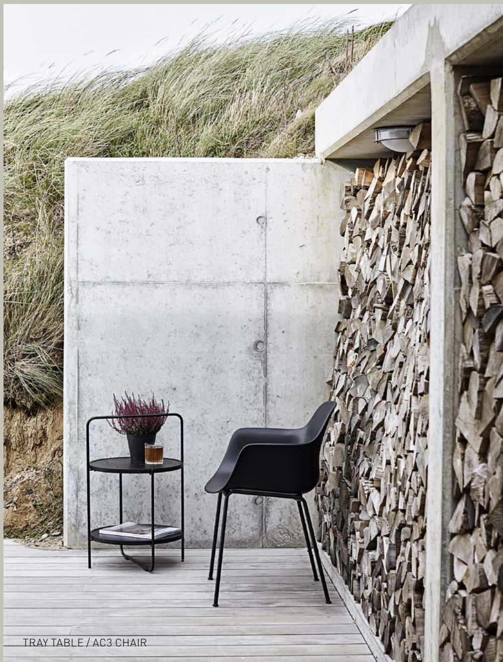
TRAY TABLE / AC3 CHAIR