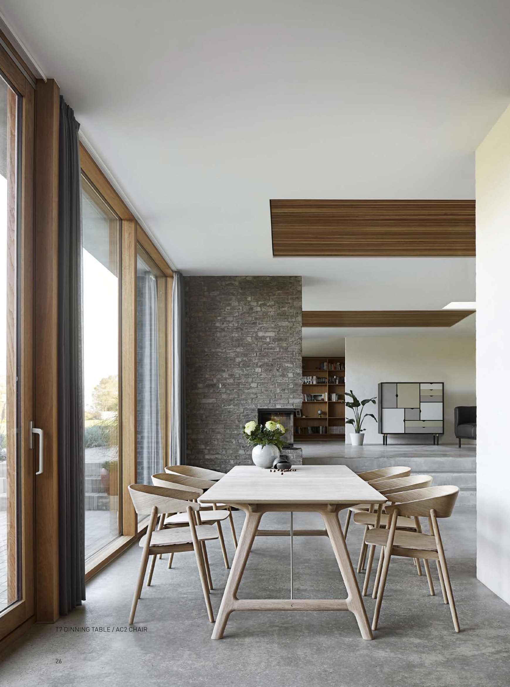
T7 DINING TABLE / AC2 CHAIR