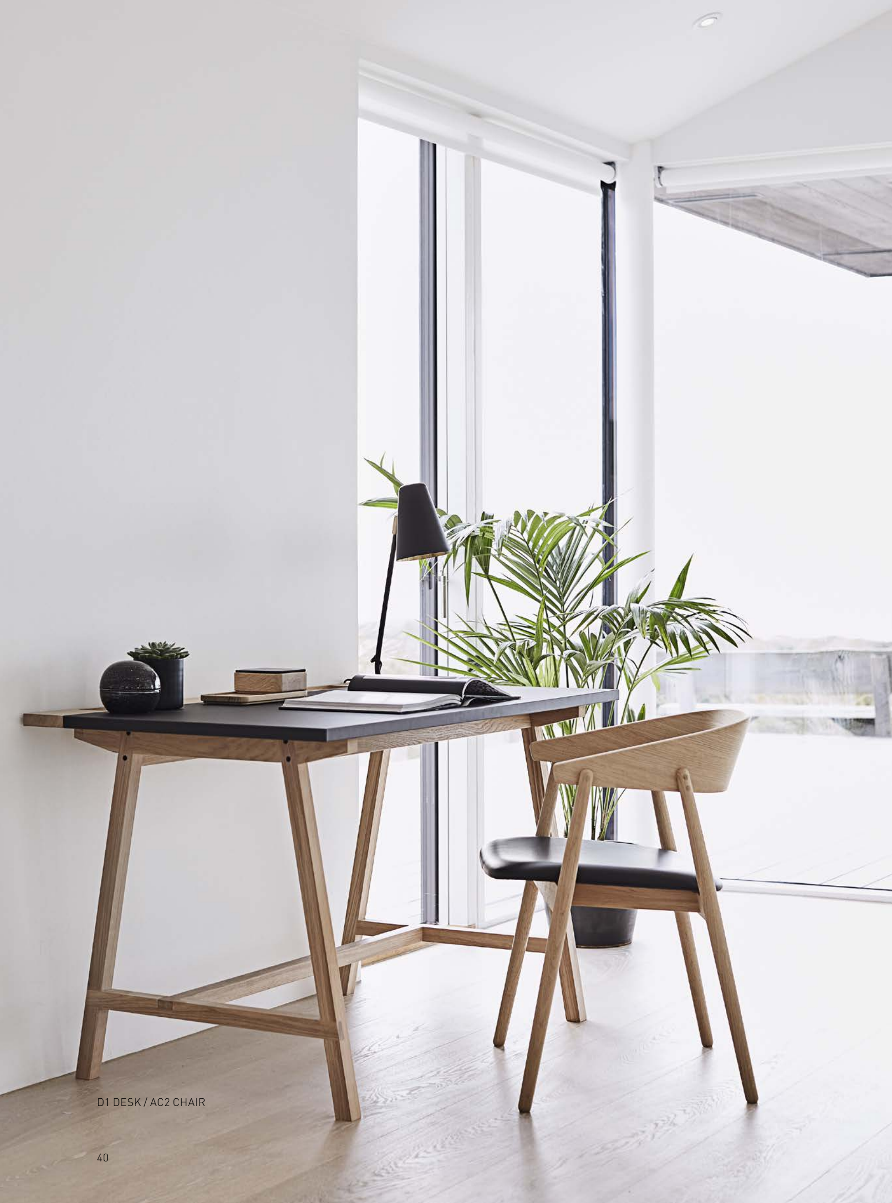
D1 DESK / AC2 CHAIR