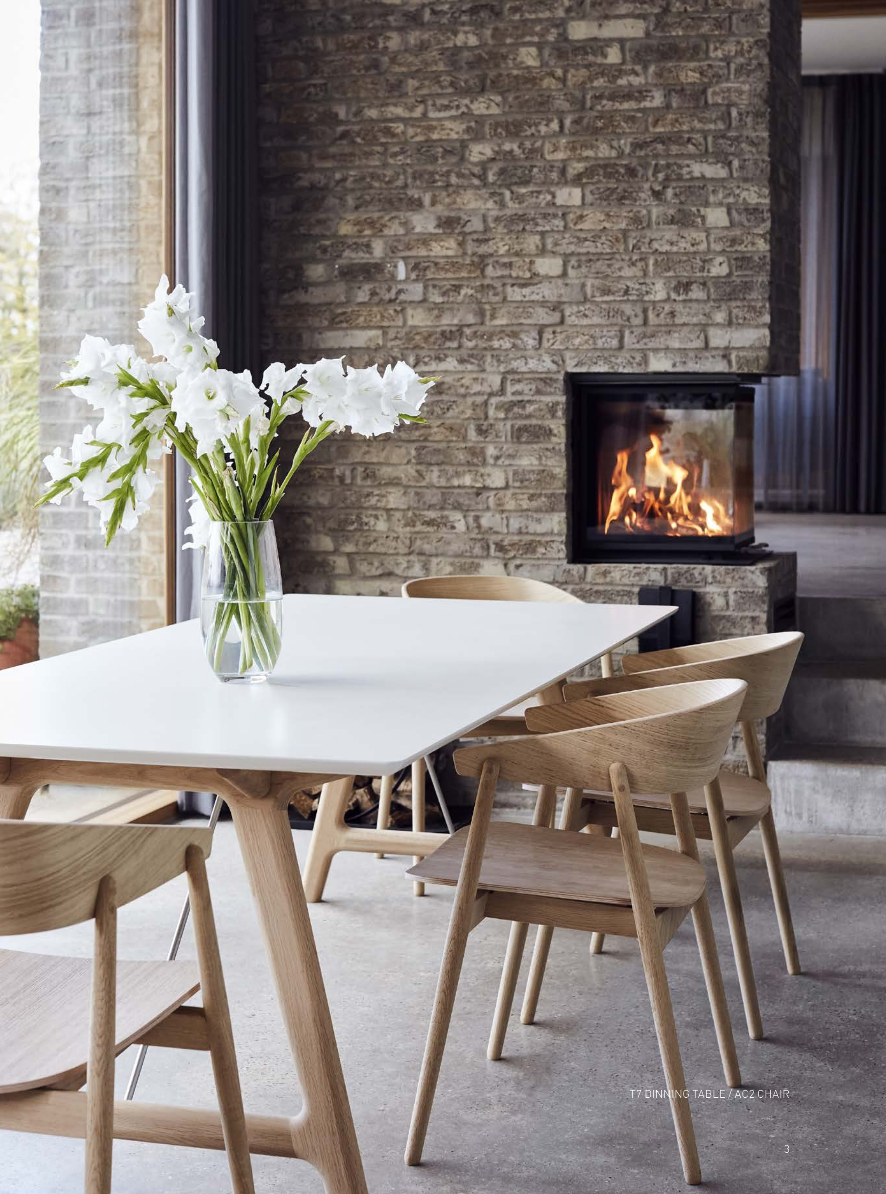
T7 DINING TABLE / AC2 CHAIR