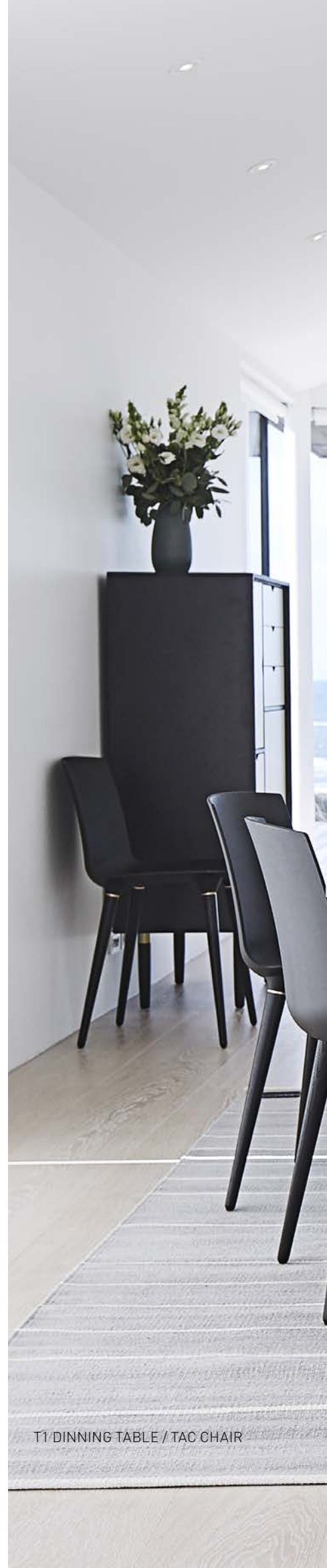
T1 DINNING TABLE / TAC CHAIR