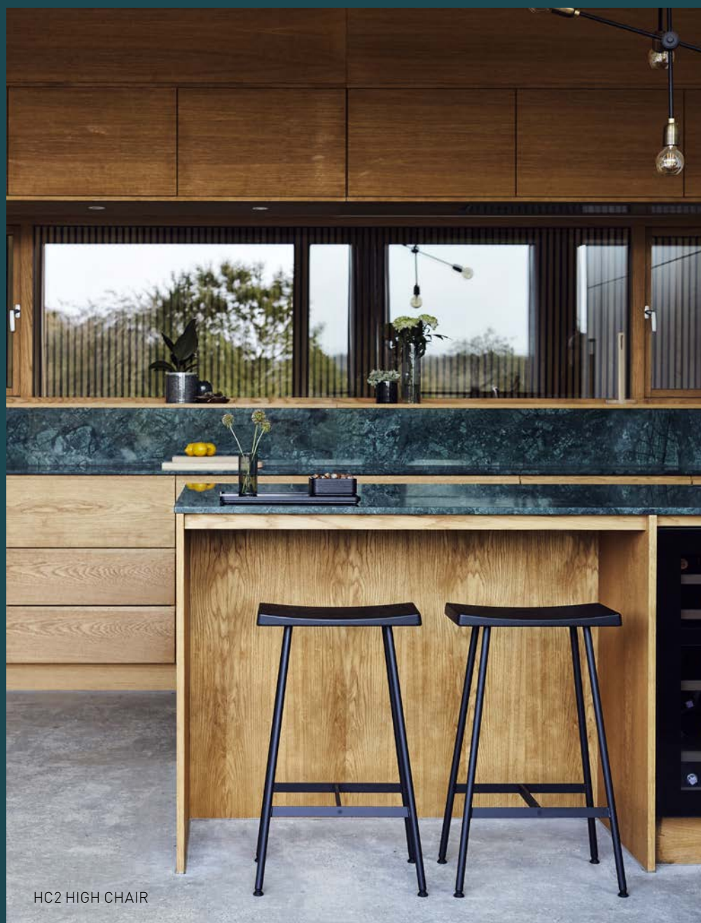
HC2 HIGH CHAIR