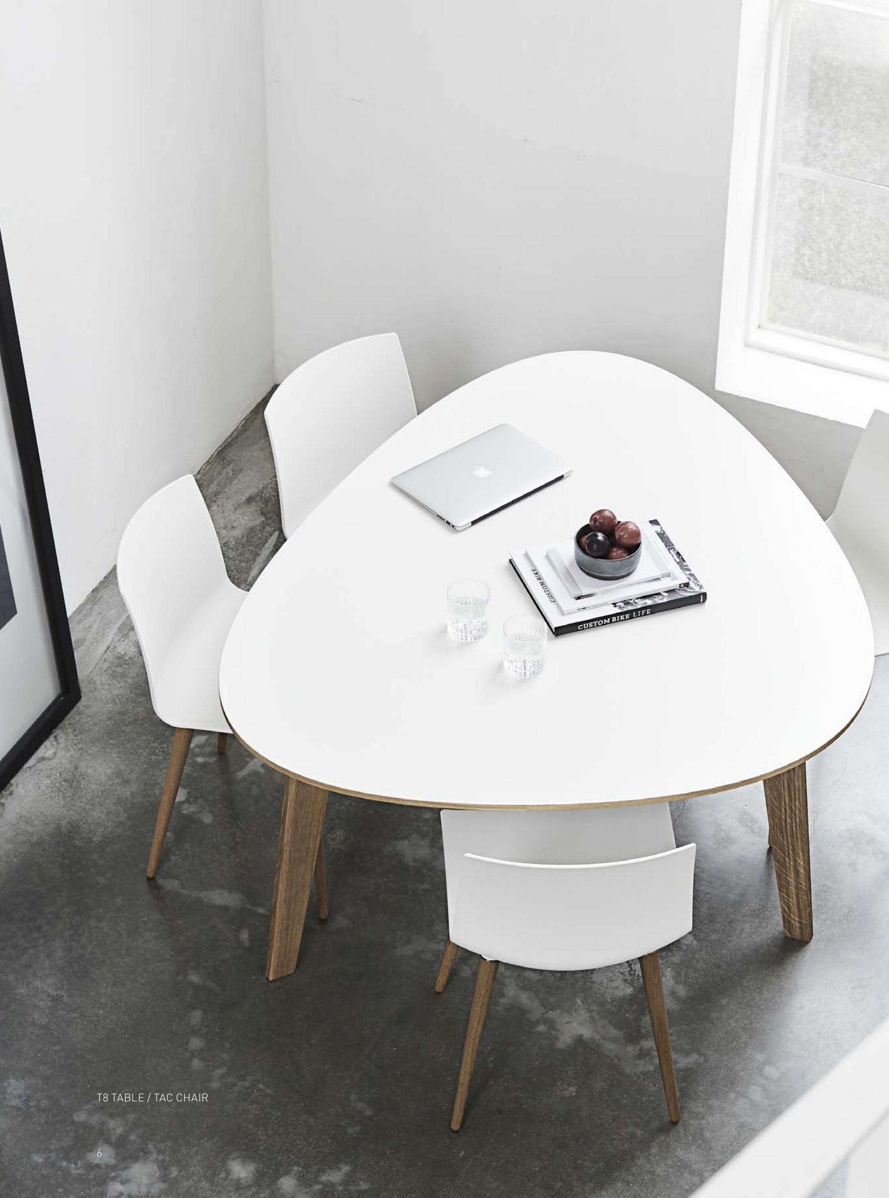
T8 TABLE / TAC CHAIR