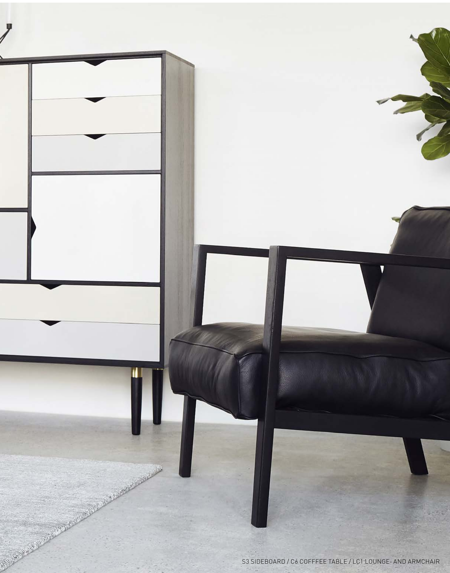
S3 SIDEBOARD / C6 COFFEE TABLE / LC1 LOUNGE- AND ARMCHAIR