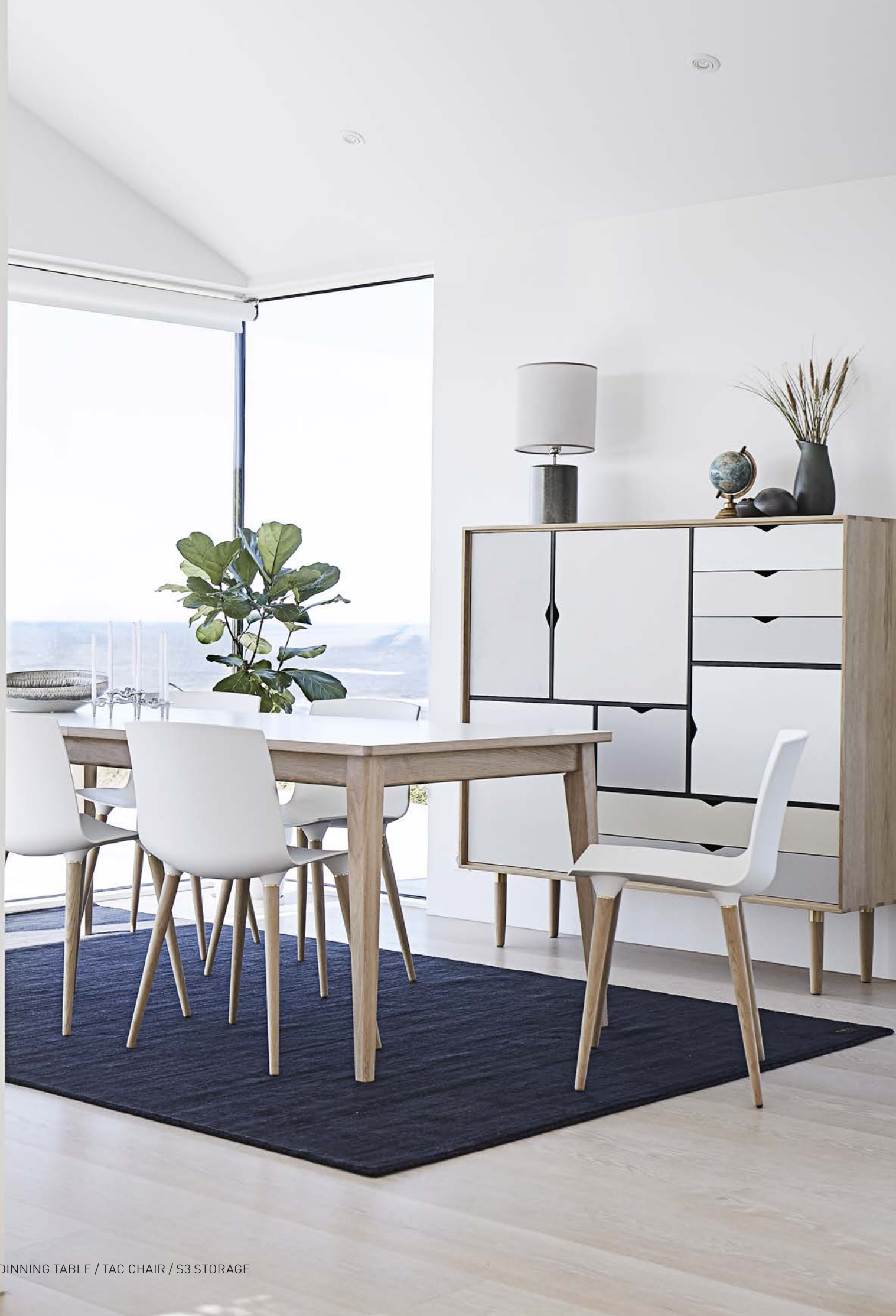
T3 DINNING TABLE / TAC CHAIR / S3 STORAGE