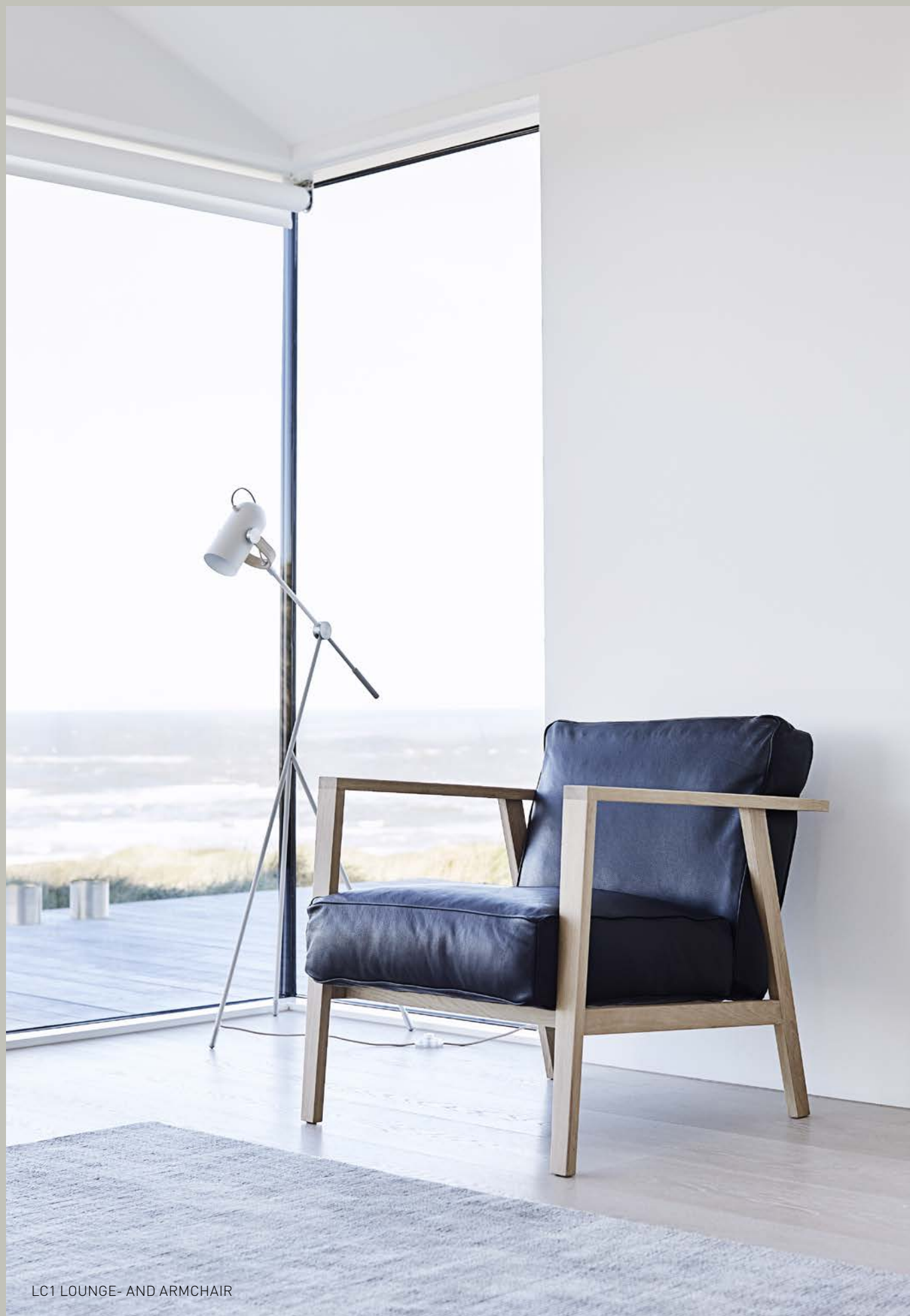
LC1 LOUNGE- AND ARMCHAIR