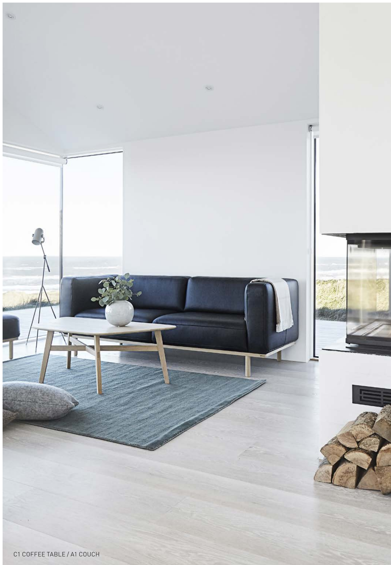
C1 COFFEE TABLE / A1 COUCH