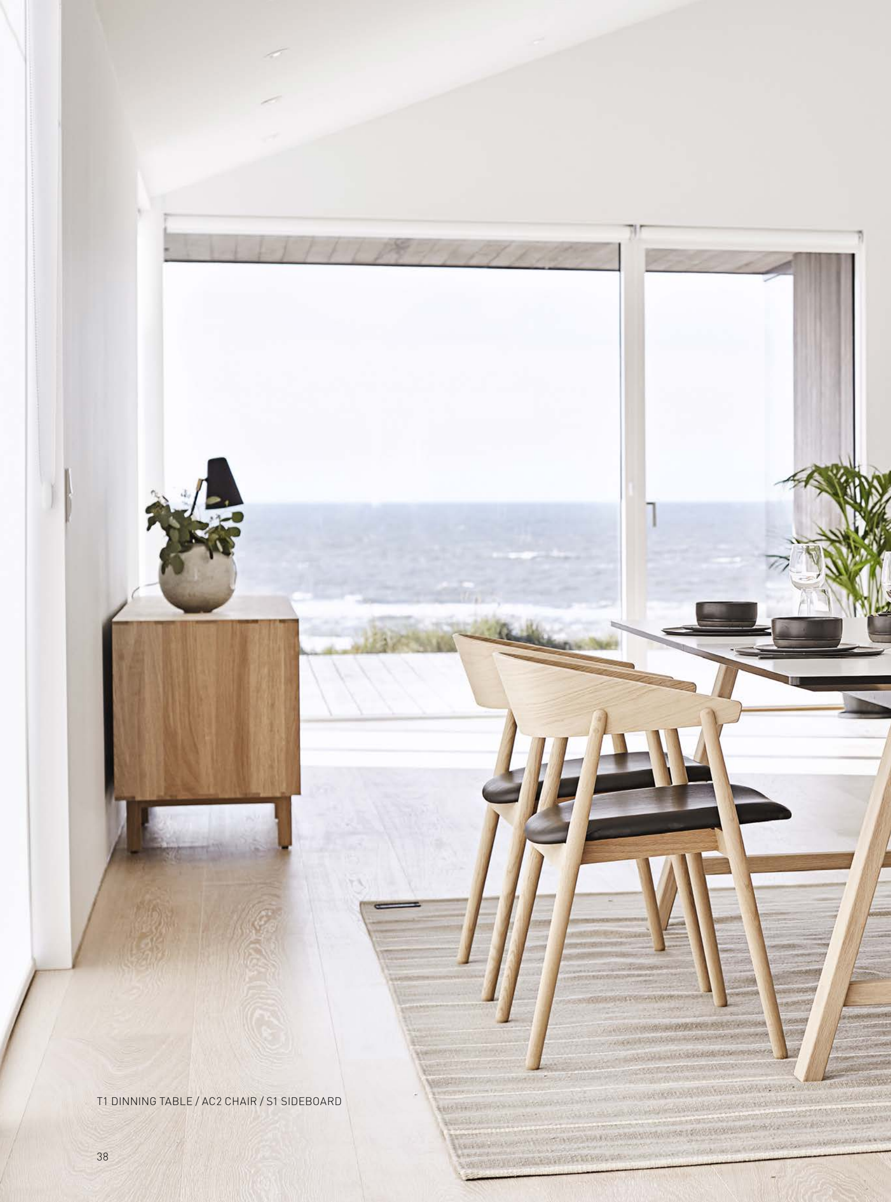
T1 DINNING TABLE / AC2 CHAIR / S1 SIDEBBOARD