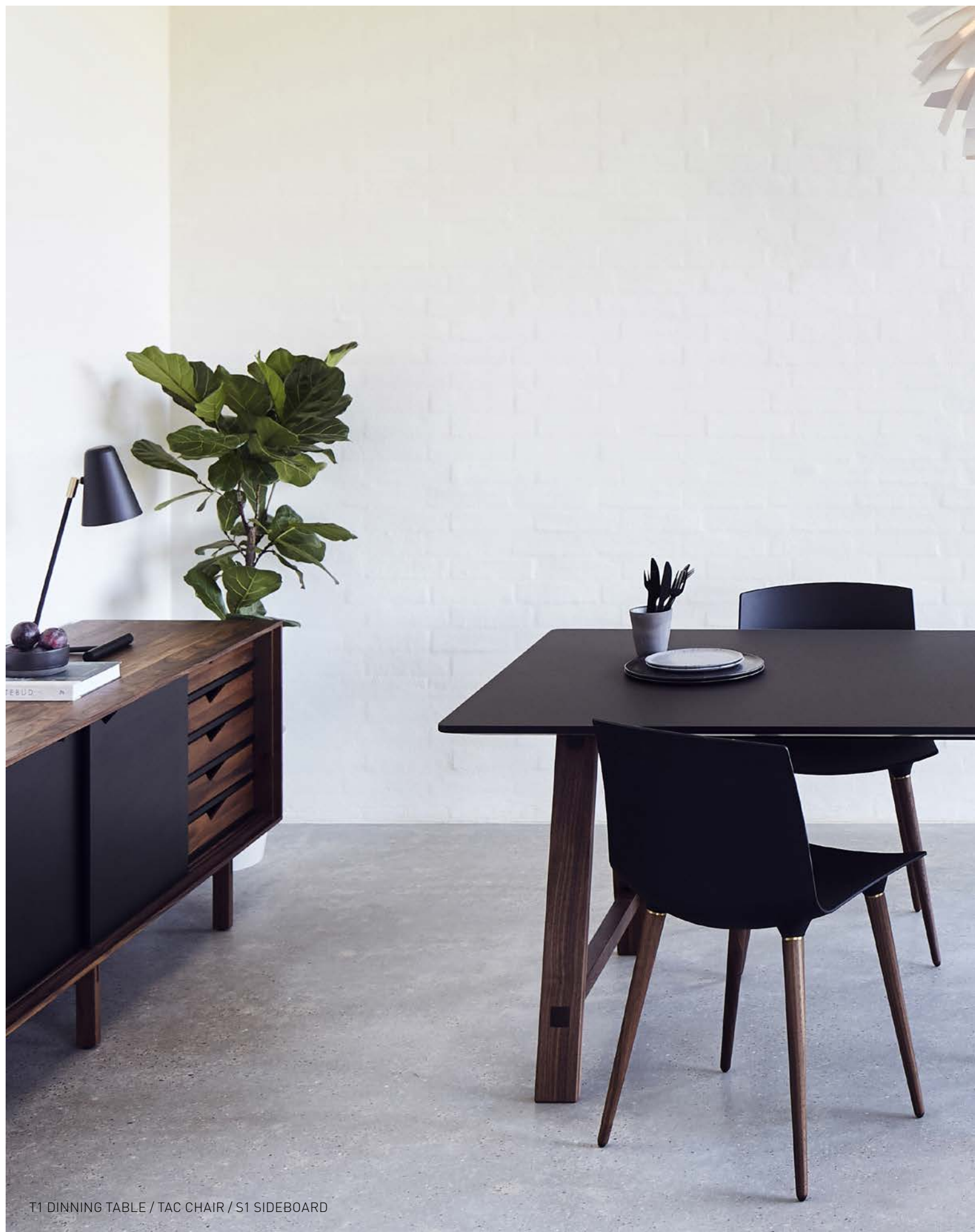
T1 DINNING TABLE / TAC CHAIR / S1 SIDEBOARD