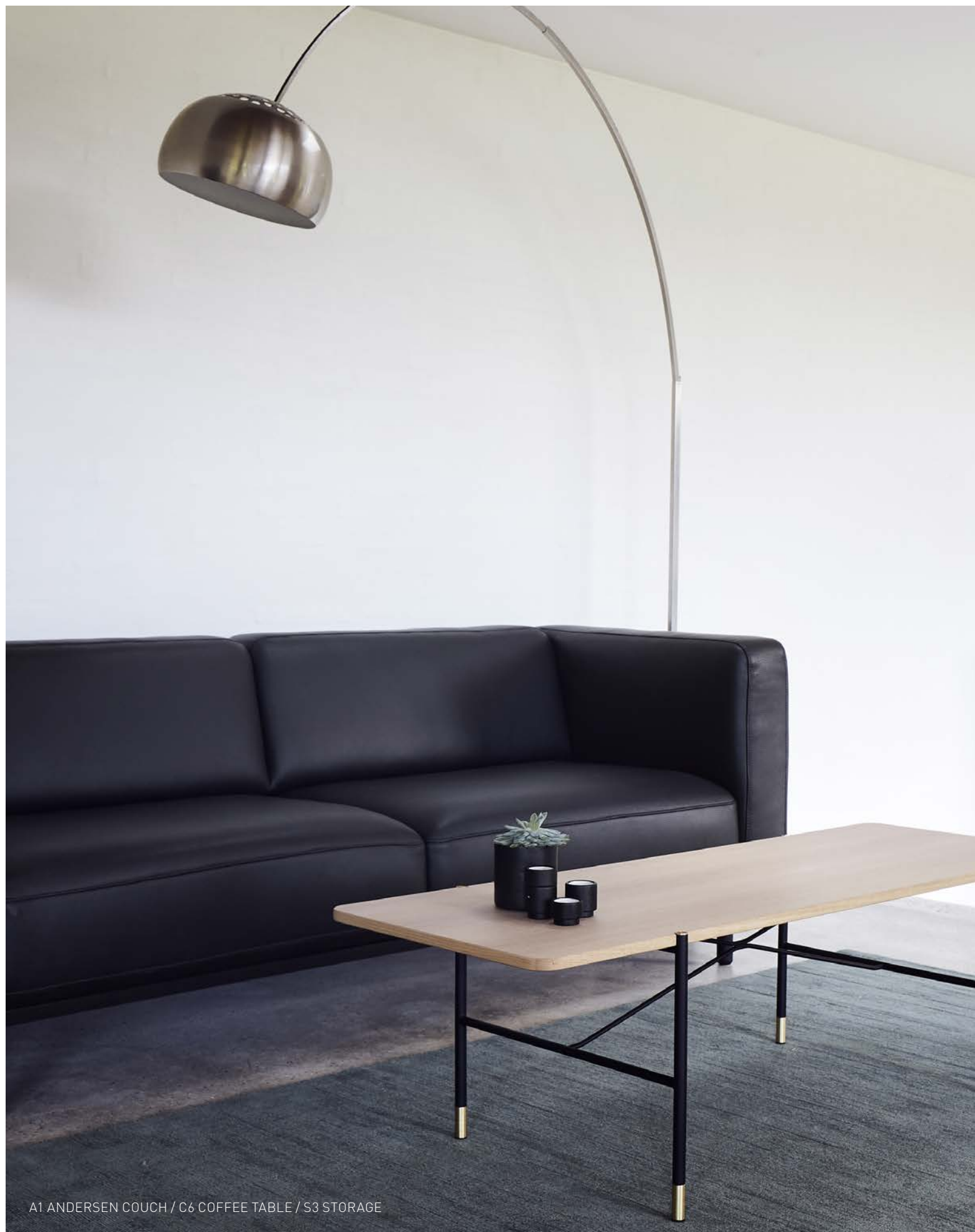
A1 ANDERSEN COUCH / C6 COFFEE TABLE / S3 STORAGE