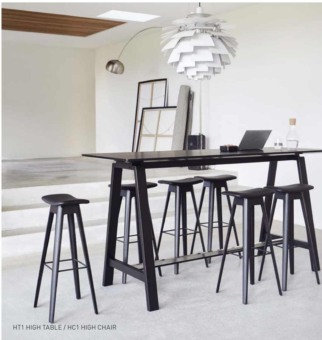
HT1 HIGH TABLE / HC1 HIGH CHAIR