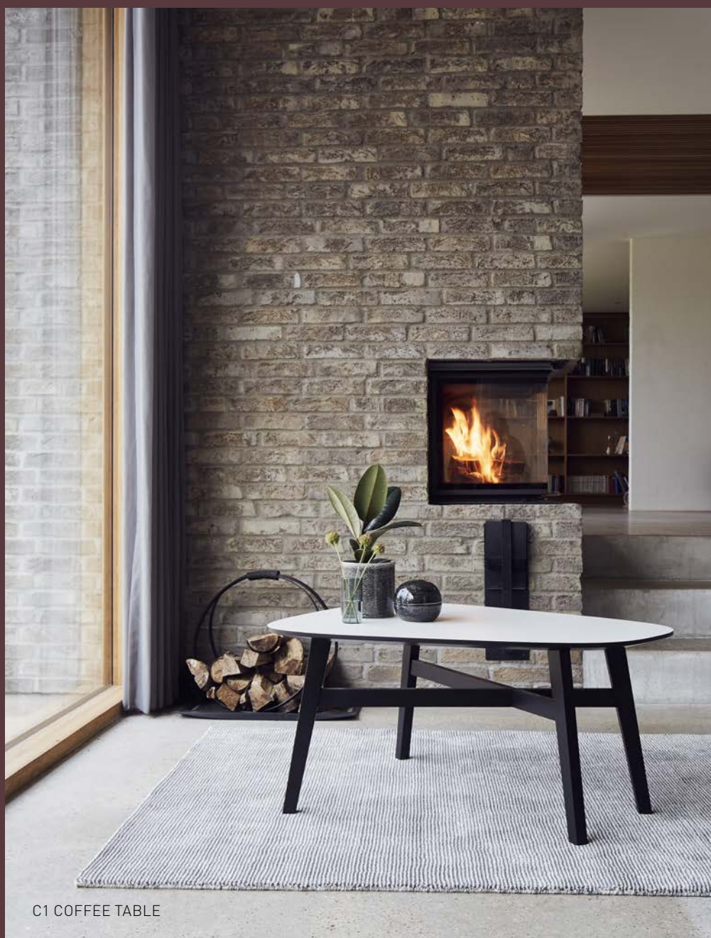
C1 COFFEE TABLE