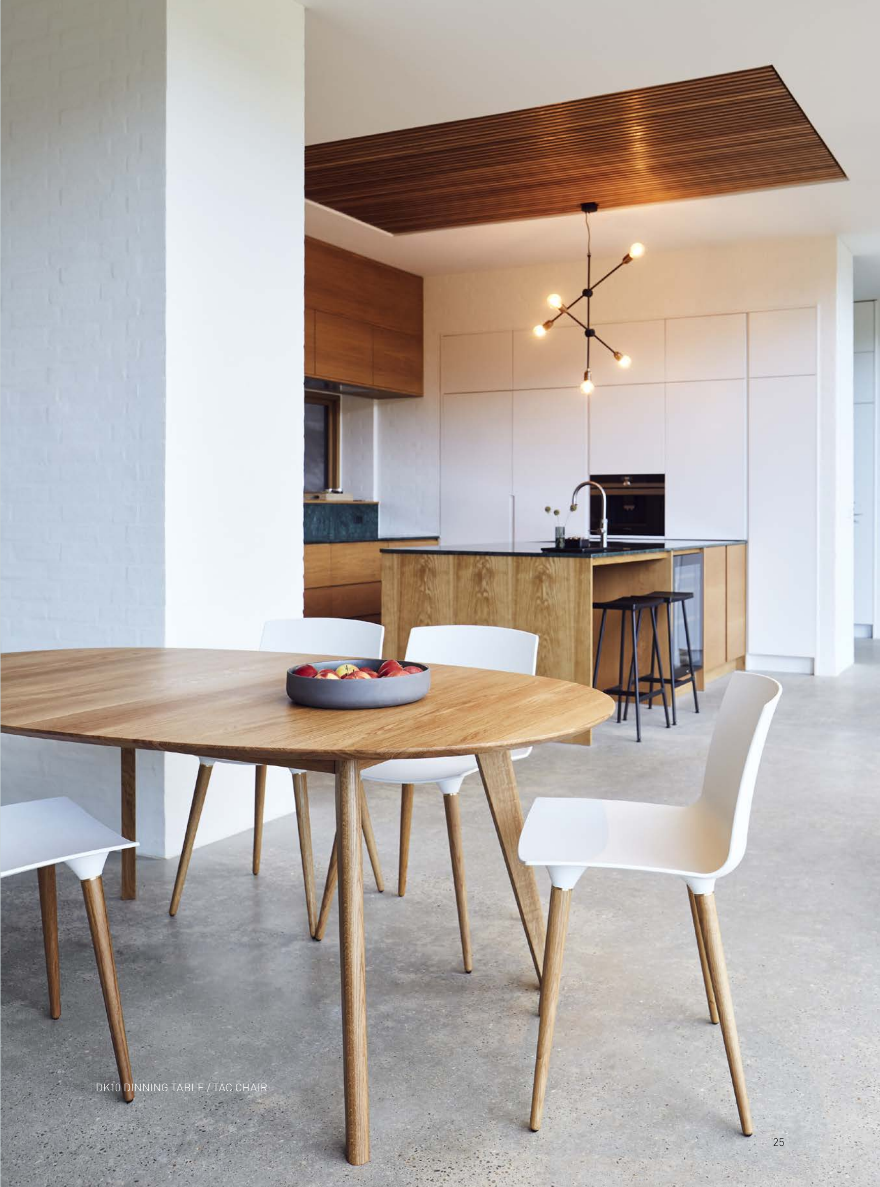
DK10 DINNING TABLE / TAC CHAIR