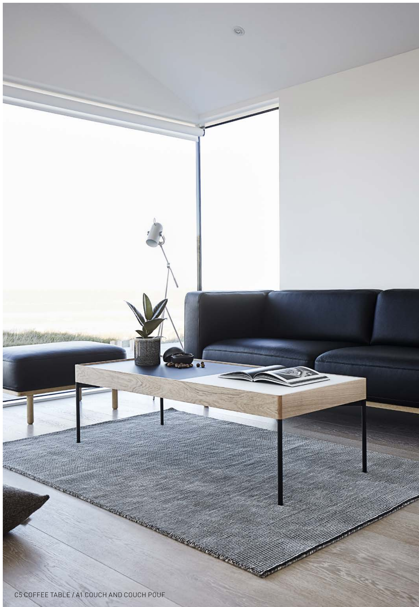
C5 COFFEE TABLE / A1 COUCH AND COUCH POUF