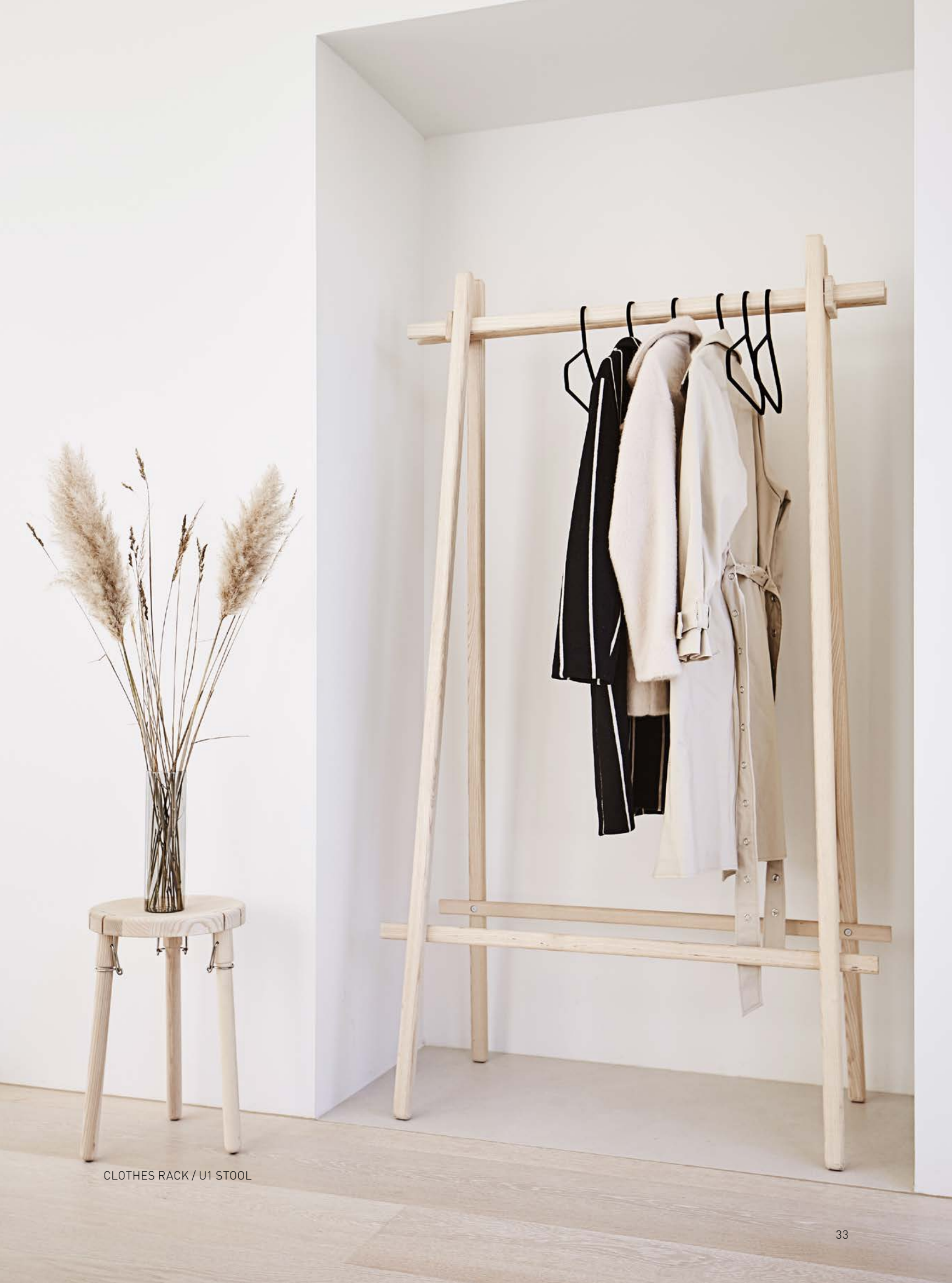
CLOTHES RACK / U1 STOOL