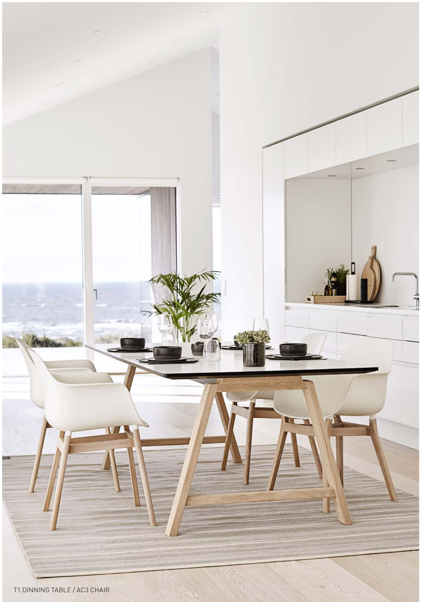
T1 DINNING TABLE / AC3 CHAIR